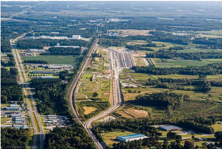
CSX Intermodal Facility

Highway improvements associated with the transportation needs of the Intermodal Facility have been completed. These improvements include: - Roadway improvements just west of rail overpass. - Significant improvements to the interchange of I-95 at NC Hwy 4. - State-of-the-art all concrete roundabout, at the northeast corner of the tract, designed to efficiently accommodate interstate tractor trailers. - A roadway bounding on the north is an overpass and thus avoids interference with rail traffic. - A third, 3-mile long track has been added to the east side of the CSX main line that offers the Intermodal Facility room for building trains prior to their exiting the Facility.